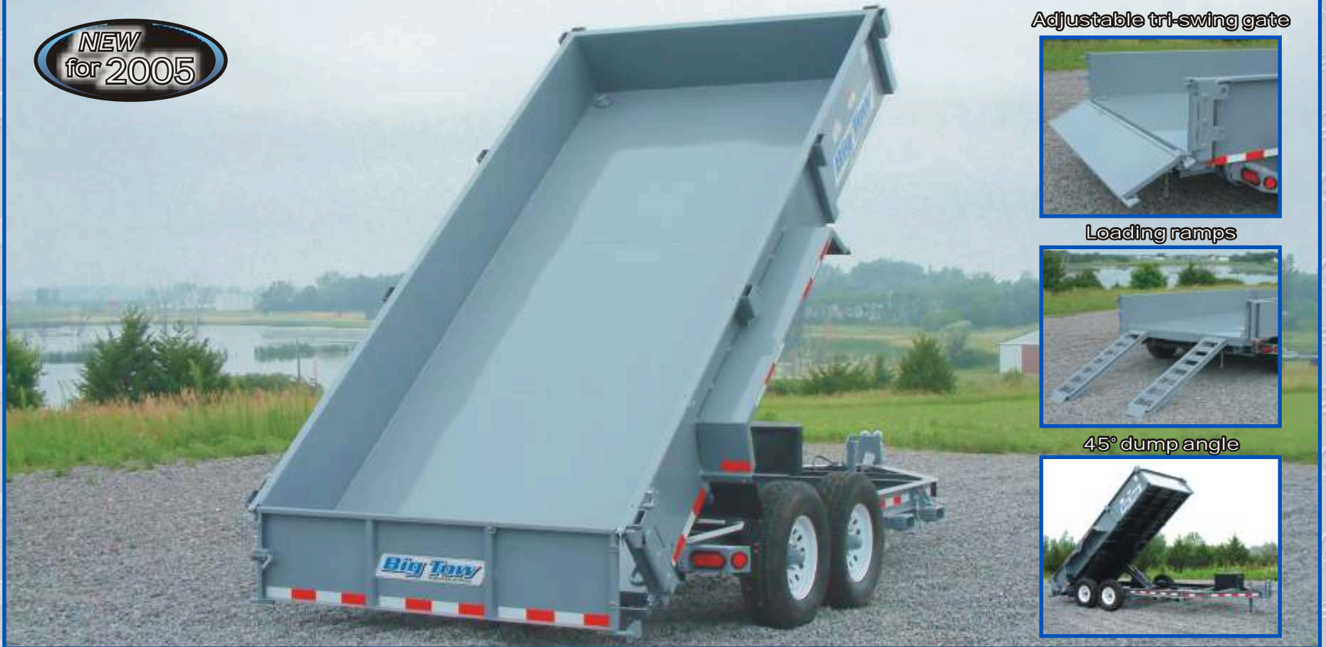
Adjustable tri-swing gate