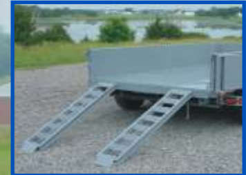
45° dump angle