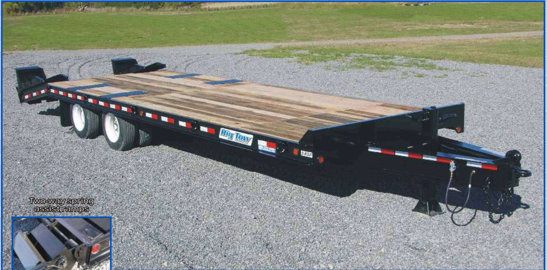
Two-way spring assist ramps

Offering a full line of the highest quality construction, utility and industrial trailers on the market - 1 ton to 55 ton capacity.