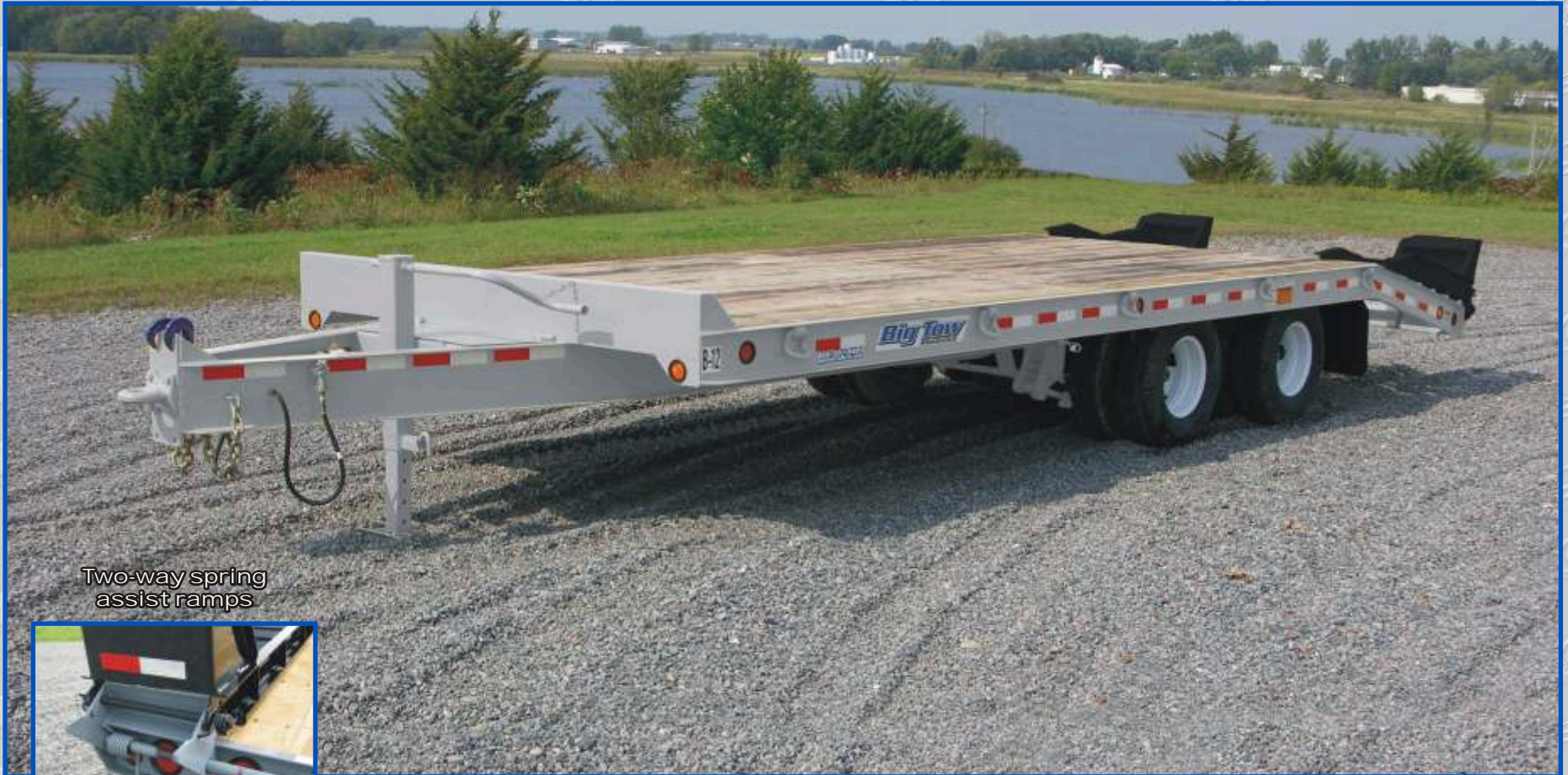
Two-way spring assist ramps

MODELS: B-10LP, B-12LP LOW PROFILE TRAILER