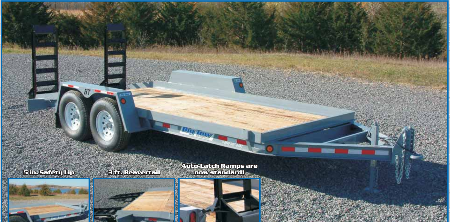
5 in. Safety Lip

MODELS: BE-5BL, BE-6BL BEAVERTAIL with LIP