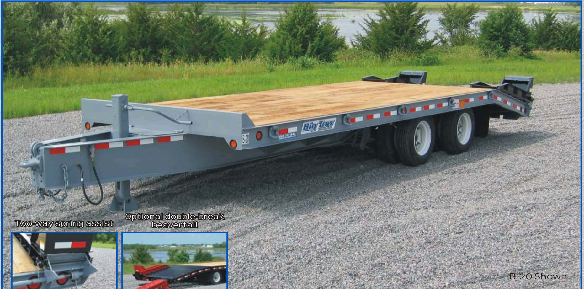
Two-way spring assist