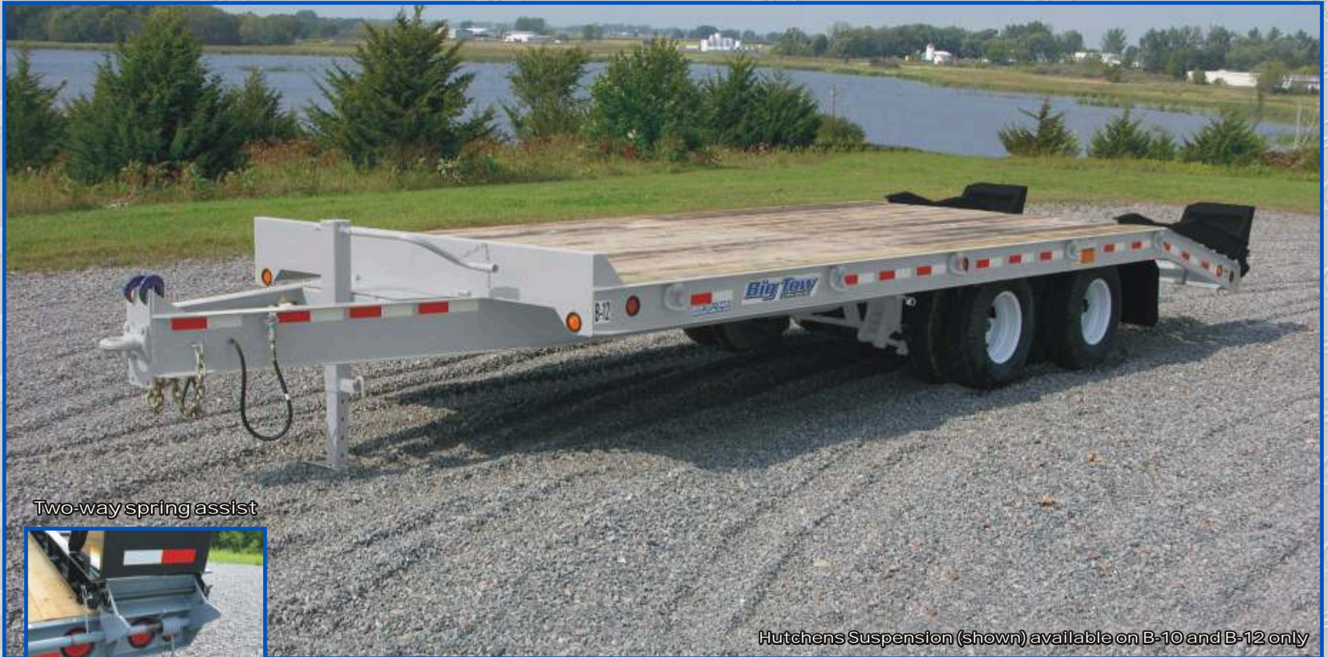
Two-way spring assist

MODELS: B-9, B-10, B12 DECK OVER TRAILER