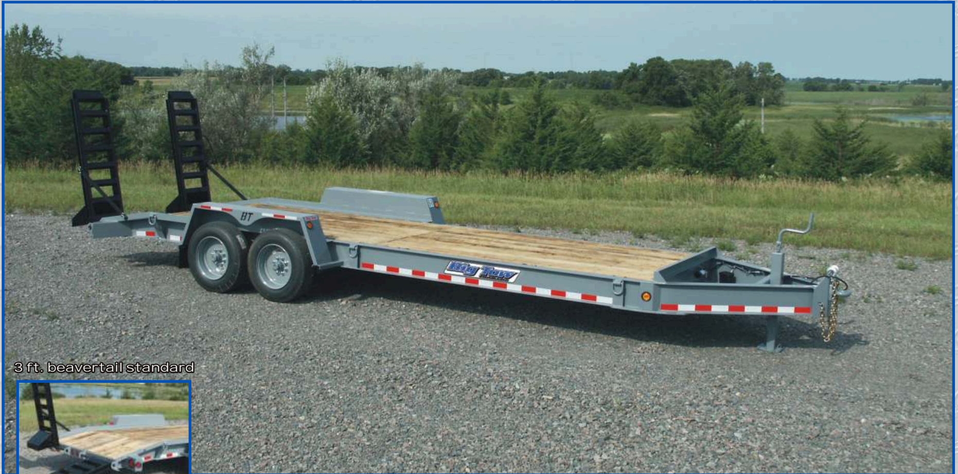
3 ft. beavertail standard