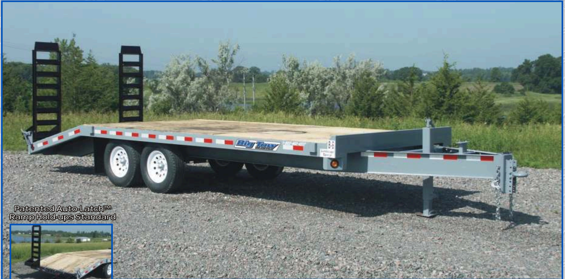
Patented Auto-Latch™ Ramp Hold-ups Standard

Offering a full line of the highest quality construction, utility and industrial trailers on the market - 1 ton to 60 ton capacity.