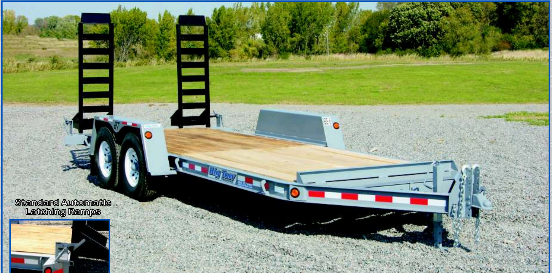
Standard Automatic Latching Ramps

Offering a full line of the highest quality construction, utility and industrial trailers on the market - 1 ton to 55 ton capacity.