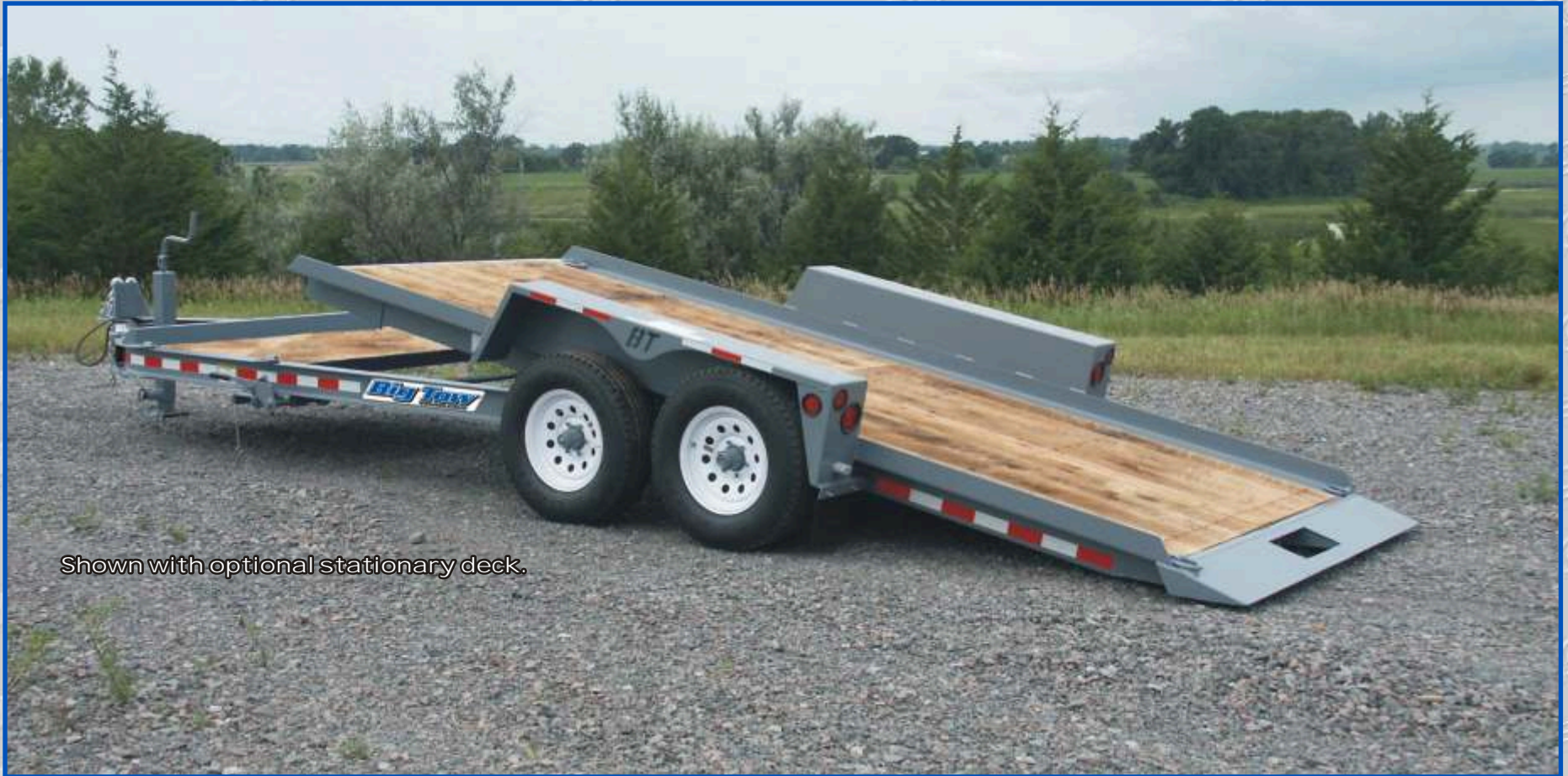
Shown with optional stationary deck.

Offering a full line of the highest quality construction, utility and industrial trailers on the market - 1 ton to 55 ton capacity.