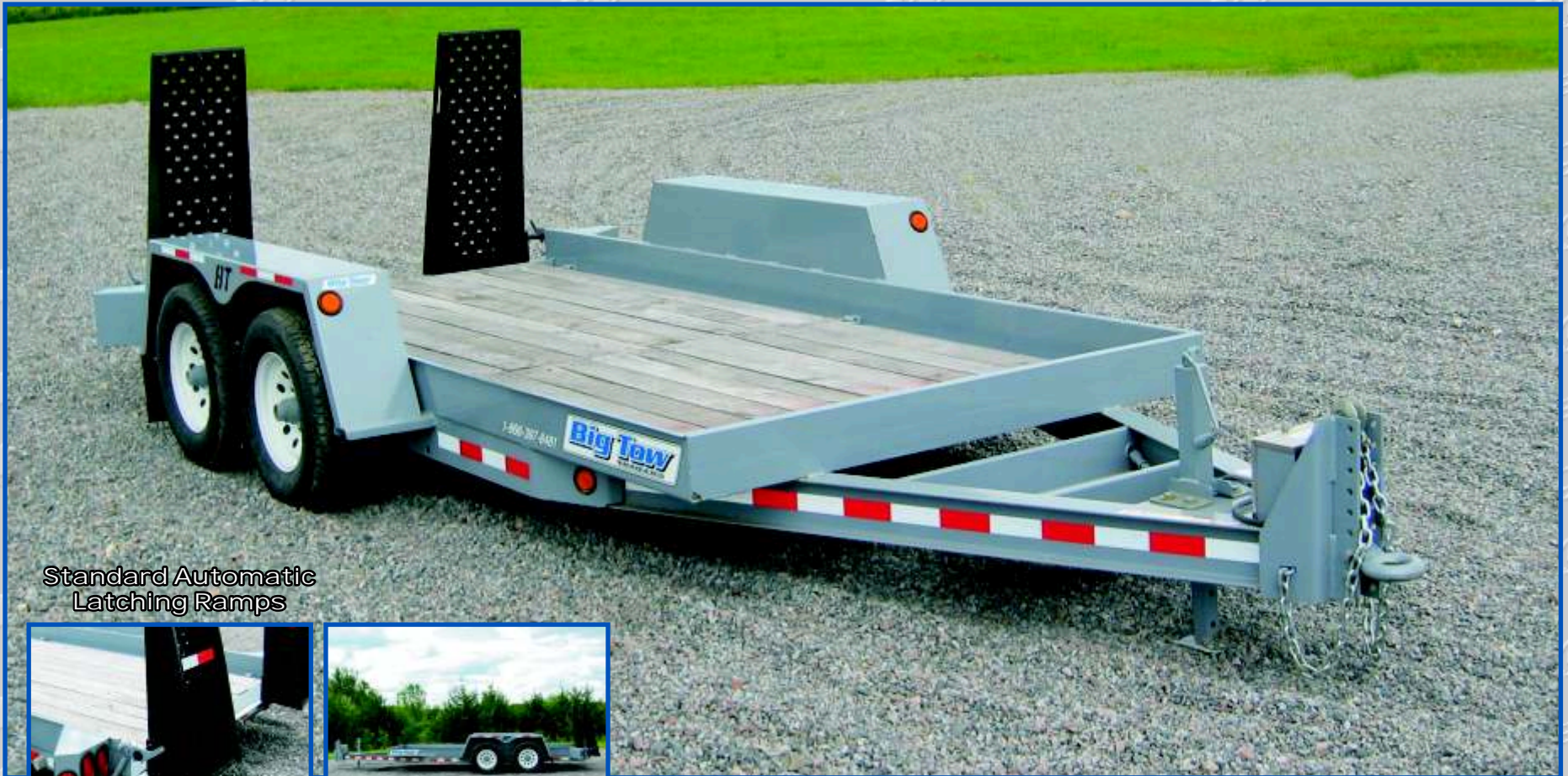
Standard Automatic Latching Ramps